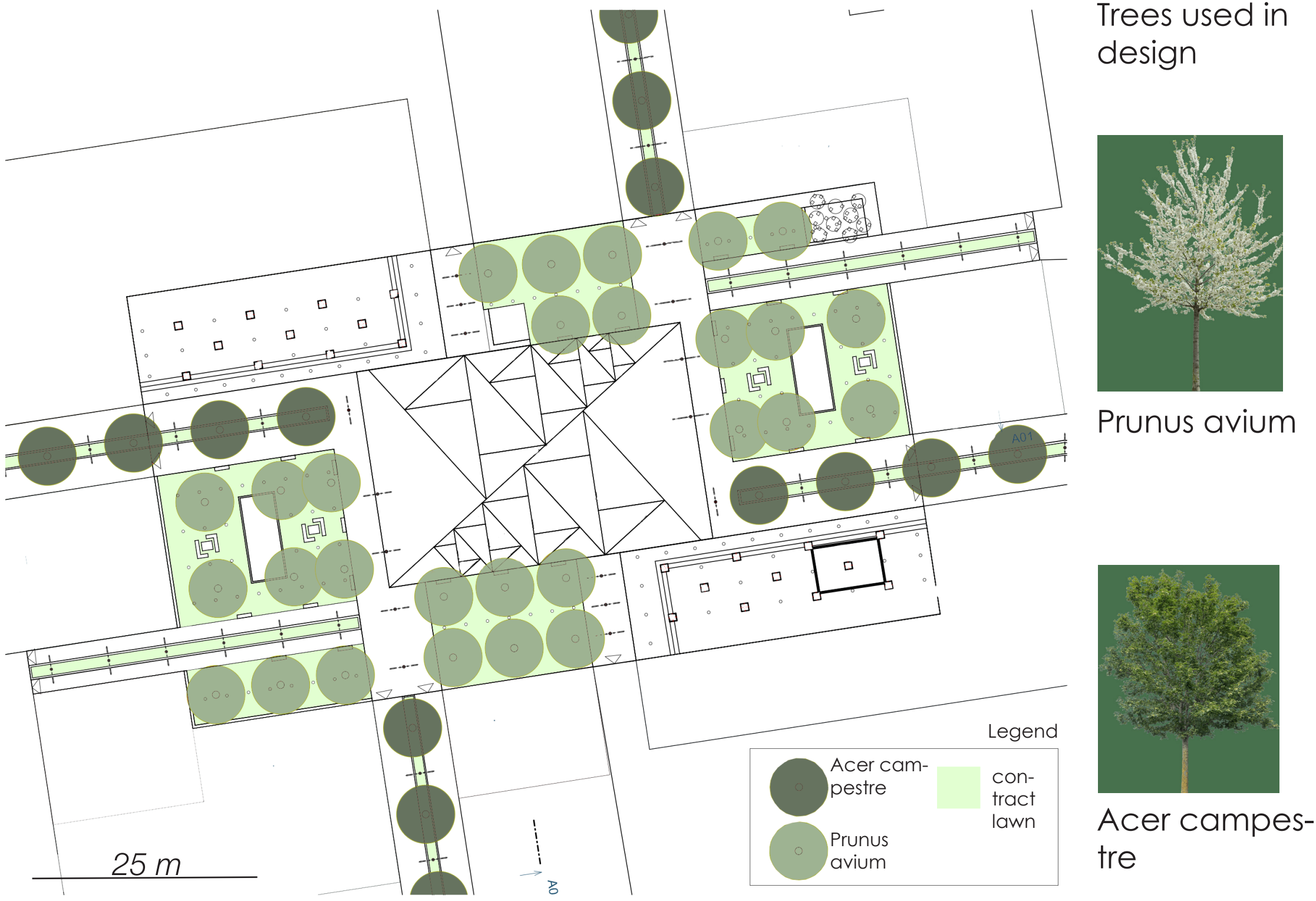
Detail of vegetation

The deck this upper part of inside square is supposed to collect water because of its triangle shapes with 2° angles.